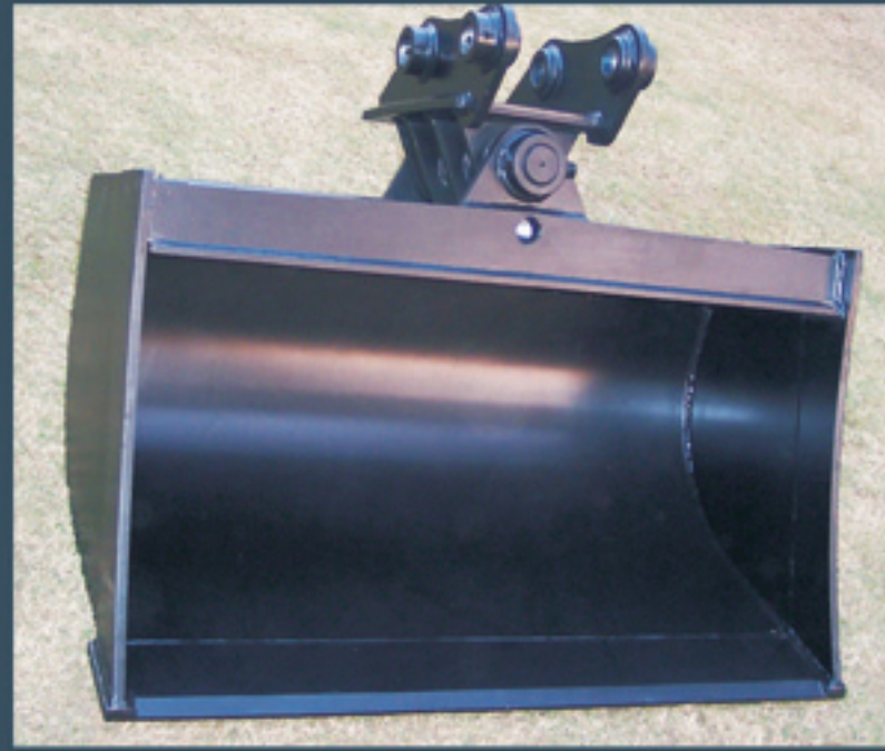
Tilting Ditching Bucket for Hitachi Backhoe

Kismet makes a variety of backhoe buckets for many machine models. Some have hardened cutting edges, liner bosses, wear strips etc. for heavy duty applications. Both weld on and bolt on type of GET are available. Typical widths vary from 12 to 36 inches.