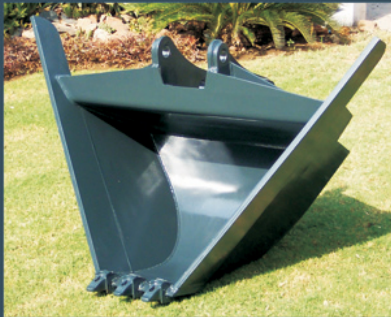
Trapezoidal Ditching Bucket for New Holland Backhoe

Front loader bucket for Volvo backhoe with the provision for adding on a hardened blade which can be parked on top of the bucket when not required. Can be coupled with the quick hitch.