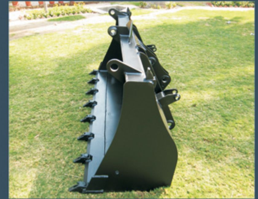
Loader Bucket for Volvo BL 61

Hydraulically operated dual cylinder bucket which tilts 45 degrees in each direction. Hardened cutting edge. Is available with a hydraulic quick hitch for more flexible operation. Also available for other backhoes. Widths can be upto 1.8 m.