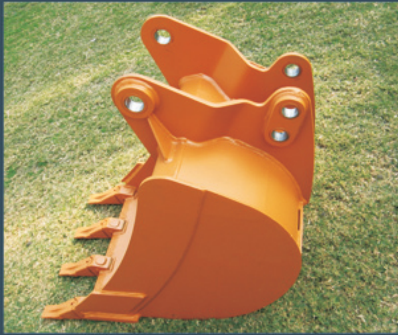
Case 580 Backhoe Bucket

Kismet makes a variety of backhoe buckets for many machine models. Some have hardened cutting edges, liner bosses, wear strips etc. for heavy duty applications. Both weld on and bolt on type of GET are available. Typical widths vary from 12 to 36 inches.