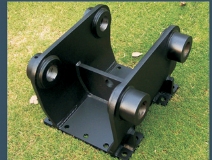
Adapter Bracket for Sandvik Rammer Rock Breaker

One of the more popular attachments made by us. Some models have drainage holes for cleaning ditches; blades can be made of high tensile or abrasion resistant steels.